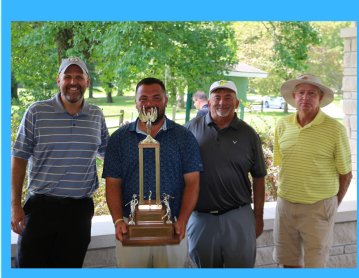
2024 TOURNAMENT CHAMPION AMERICAN RENTAL